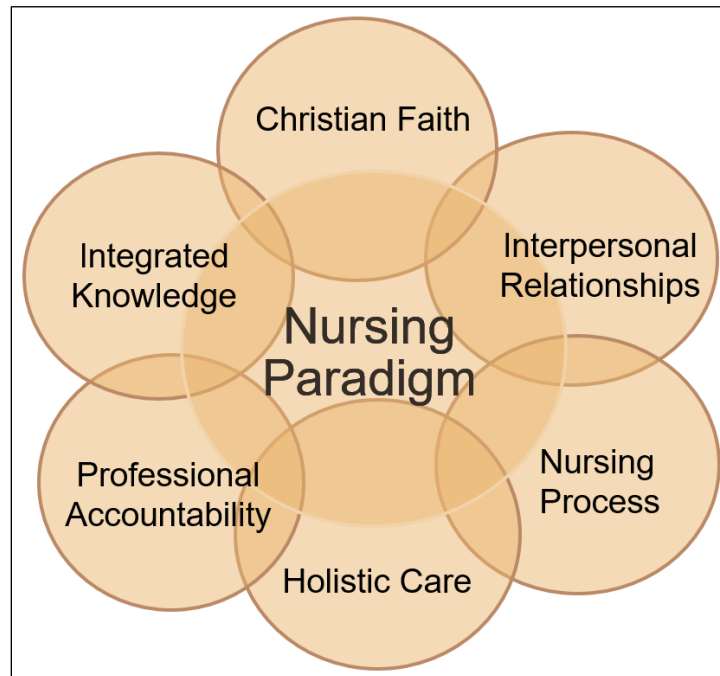
Figure 1. Department of Nursing Conceptual Framework

In line with many of the grand theorists of nursing, the philosophy of the nursing programs center on four foundational nursing concepts that include person, environment, health, and nursing. The faculty believe that situating the nursing paradigm within the conceptual framework of the nursing curriculum provides for the organization of content, skills, and expected professional behavior (See Figure 1).